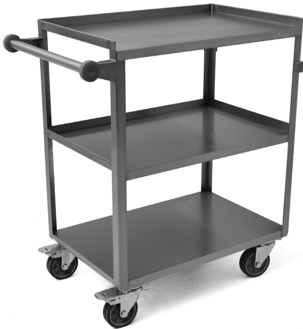
"UC" cart with upturns on ends and rear of top and center shelves

Eagle Stainless Steel Utility Cart, model _____. Three stainless steel shelves welded to angle legs. Galvanized caster channel frame. Available with standard 1"-high upturn on ends and rear of top and center shelves, or 1"-high upturn on all sides of all shelves. Four 4"-diameter swivel plate casters (two with brakes). 1"-diameter handle on one end.