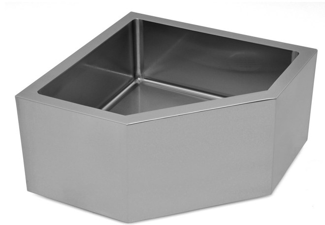
corner mop sink #F2121-8-CNR