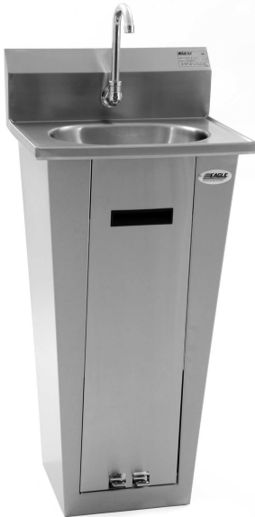
HSA-10-FA-P foot valve-operated hand sink