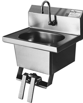
HSA-10-FK knee valve-operated hand sink